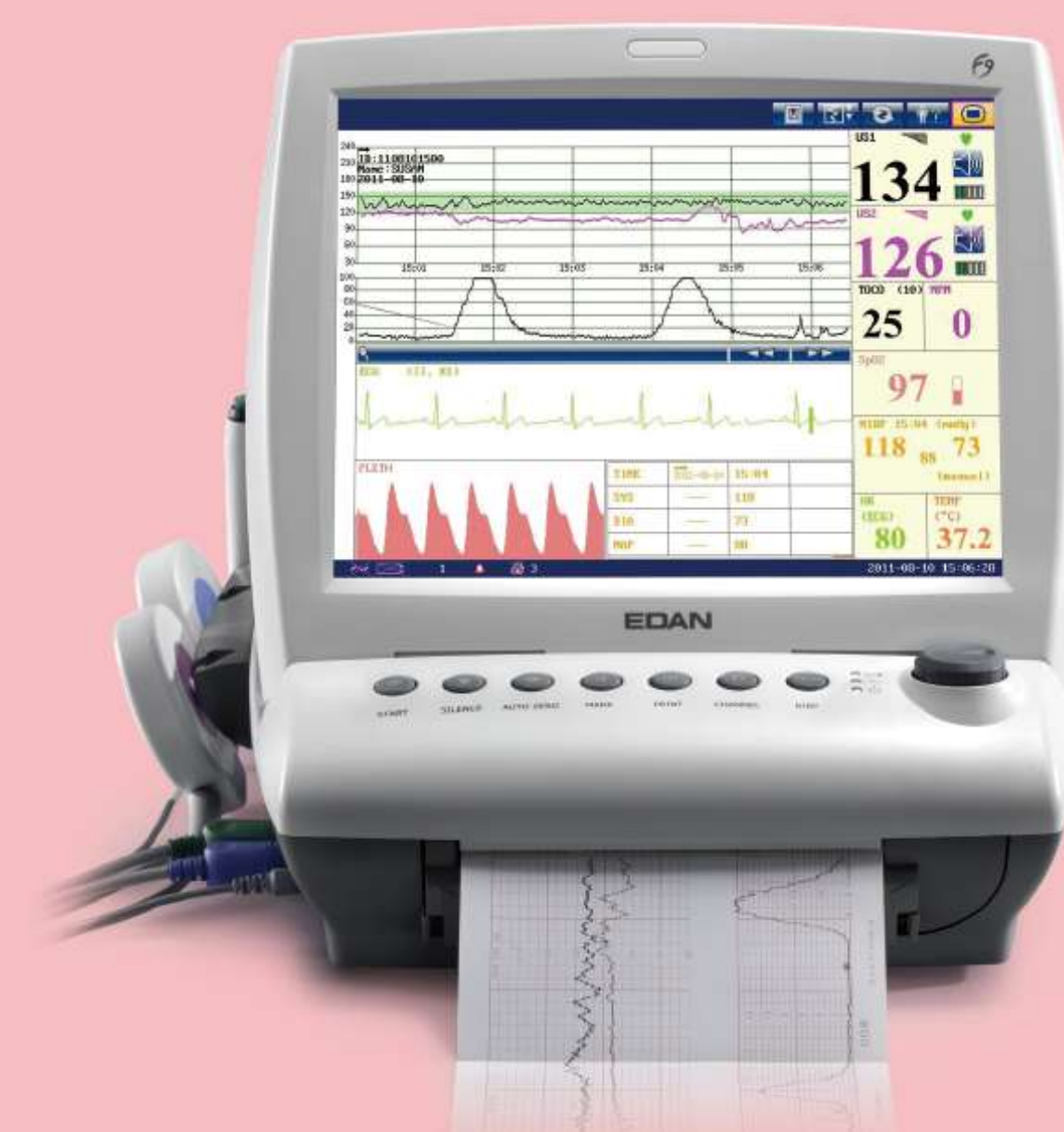
F9 Series Fetal & Maternal Monitor