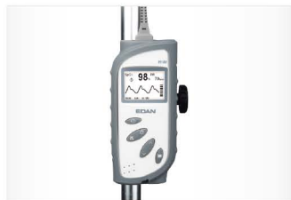
Bed Rail Mount