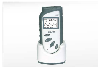
Battery Charger Stand