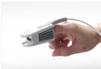
Unique Sensor Design