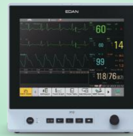
X series Patient Monitor